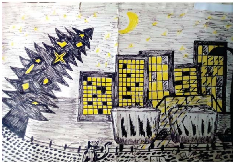
Fig. 3 – “Town at night” with two contrast colours – black and yellow (2 x paper sheet).