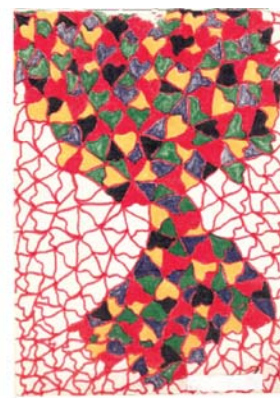
Fig. 2 – Similar picture to the first one (1/2 paper sheet).

She avoided to discuss about them. On the next session she chose double size of paper and titled it “Town at night” (Figure 3). She used only two colours (black and yellow) with great contrast and with numerous squares for windows. Other patients liked her work and asked her about the perspective in the left corner of the drawing, but she told that there was not enough place for the tree. She named the last drawing “A boy with the guitare” (Figure 4) and explained that she had the guitare at home and played sometimes it. Following completion of day treatment the repeated PANSS score was 48. However, the patient was positive about her participation in the group analysis of drawings and in other group activities, suggesting a qualitative benefit from the treatment. The team members observed that she slightly diminished avoidance with less fear and spoke with other patients not only during therapies, but also between structured activities.