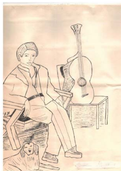
Fig. 4 – “The boy with the guitare” (1 paper sheet).

tortion of proportions or contours, i.e. metamorphopsia, intensified appearance of colours (dyschromatopsia). These phenomena could be elicited by electrical stimulation of the occipital or the left temporolateral cortex affecting either a part or the whole visual field 11 .